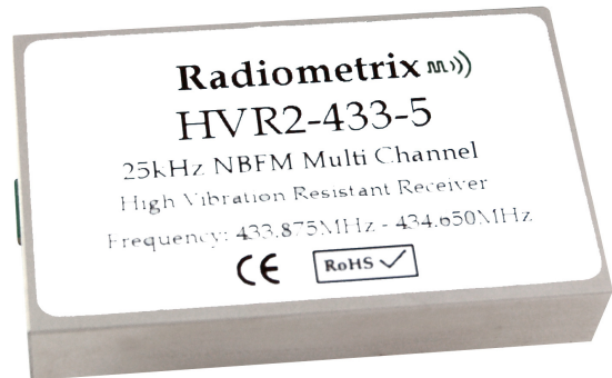
Figure 1: HVR2-433-5

The HVR2 receiver is the high vibration resistant version of the low cost RLC2H receiver. Its unique local oscillator design makes the unit almost immune to mechanical vibrations below 500Hz. This makes the HVR2 (with the matching TLC2H transmitter) to be used in mechanically troublesome areas such as crane and machine tool control, and remote operated vehicles.