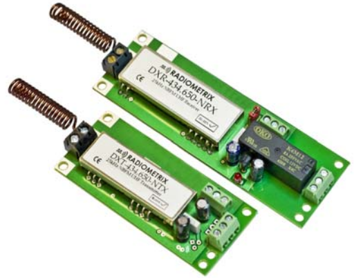
Figure 1: DX series remote control boards

The data format employed has a 16 bit address, which can be user programmed via an RS232 compatible input